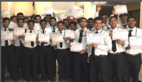
Blood Donation Drive