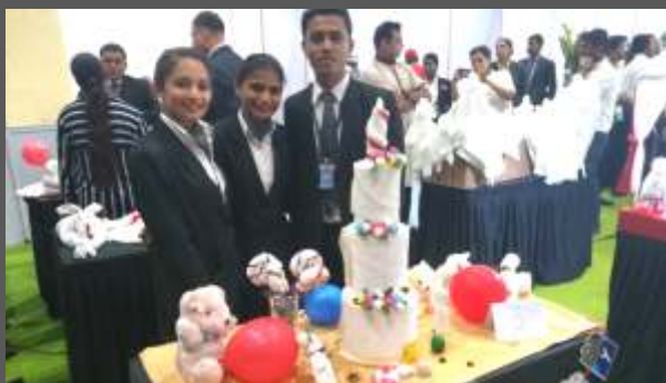
Linen Origami Competition