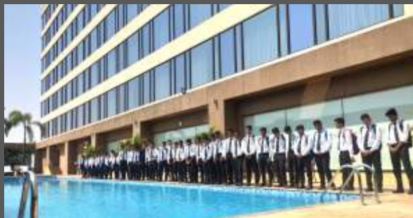
Industrial Visit to Hotel