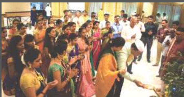
Ganapati Festival and Alumni Meet