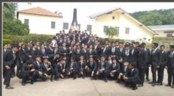
Sula Vineyard Visits