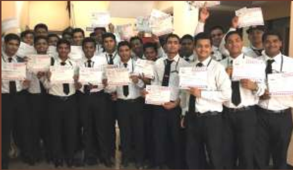
Blood Donation Drive