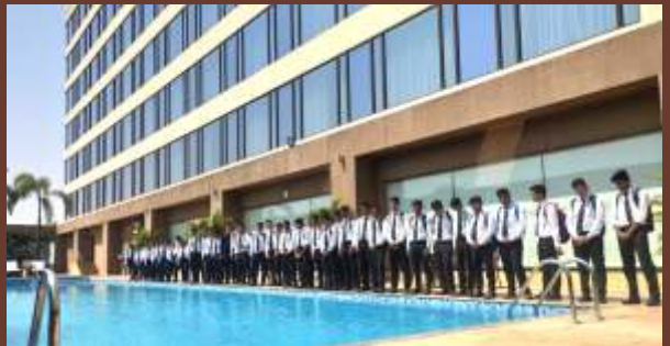
Industrial Visit to Hotel