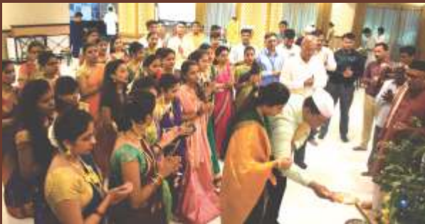
Ganapati Festival and Alumni Meet