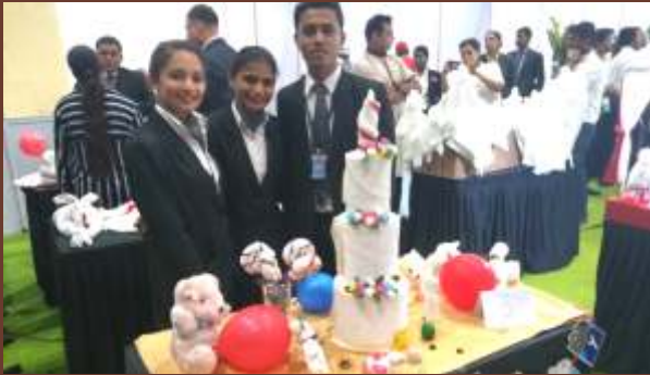
Linen Origami Competition