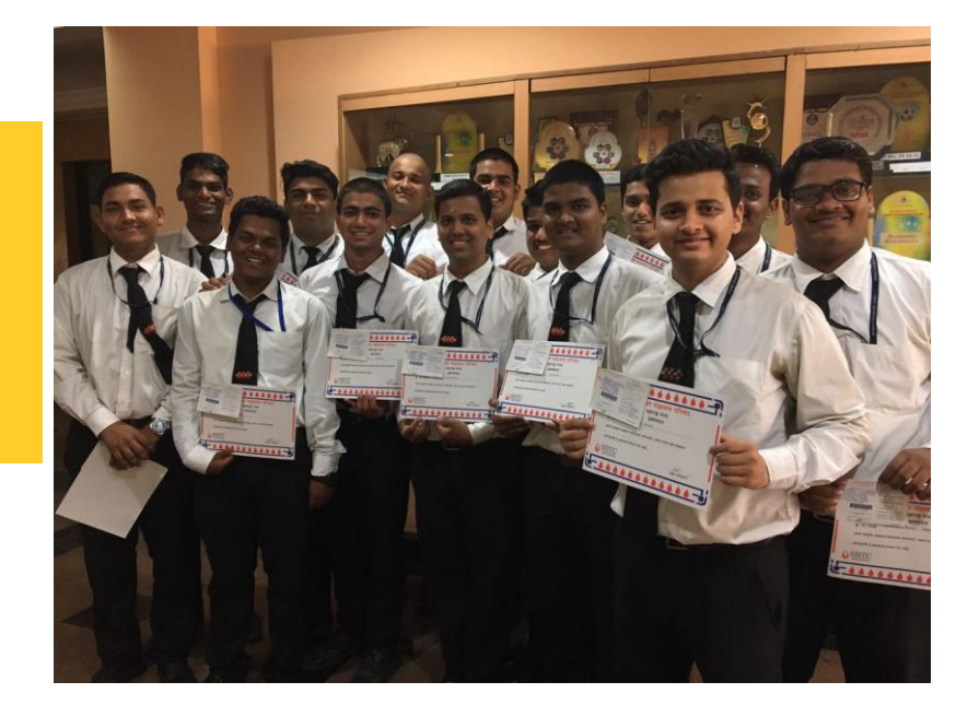
1<sup>ST</sup> AUGUST 2016 BVCHTMS STUDNETS PARTICIAPTED IN THE BLOOD DONATION DRIVE ORGANIZED BY BHARATTI VIDYAPEETH'S MCA COLLEGE

COLLEGE OF HOTEL & TOURISM MANAGEMENT STUDIES